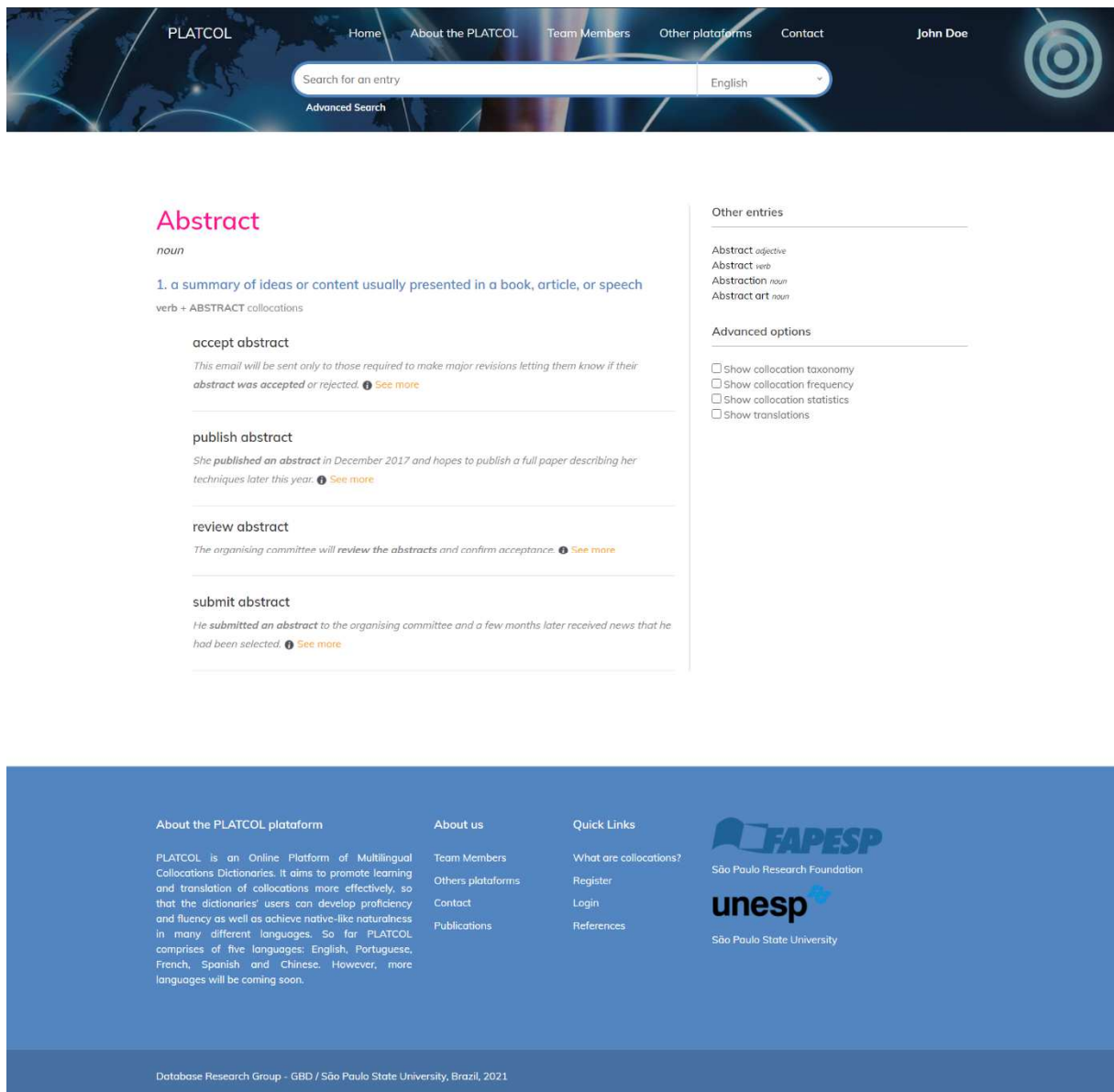
Figure 2: Screenshot of basic structure of an entry.

Besides the basic microstructure, Advanced options will be available if a user opts to sign in, according to their profile.