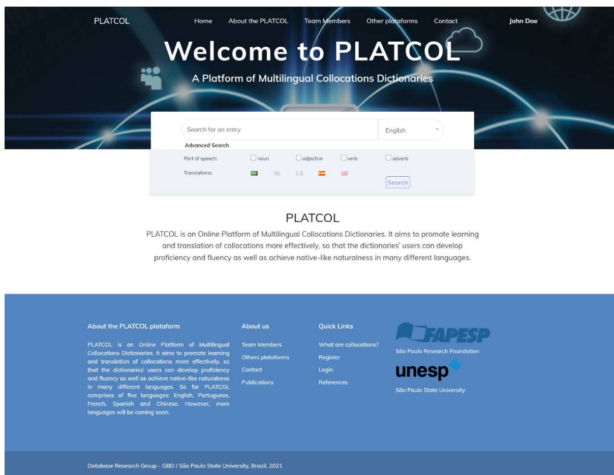
Figure 1: Screenshot of PLATCOL's Presentation Screen Prototype

The new site is under construction, as it will be adjusted to the new languages (French, Spanish and Chinese) 5 , with a more ambitious and interactive design as well as more detailed and enhanced lexicographical features and methodology.