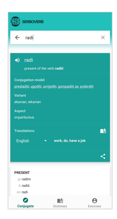
Figure 2: The conjugation module in the Android app version: a) the homepage, b) a search action, c) the conjugation result page