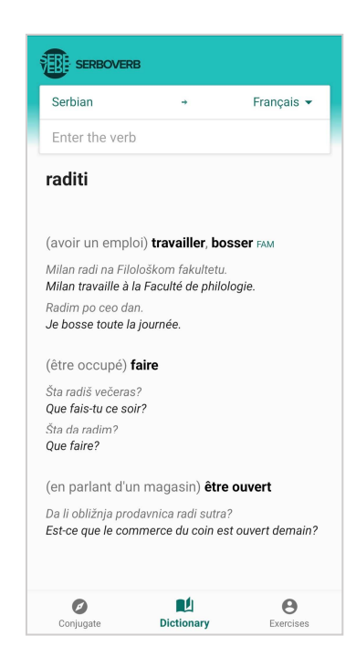
Figure 3: The conjugation and the dictionary modules in the Android app version: a) the conjugation result page, b) switching a language, c) dictionary view